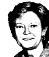
Pat Summitt 1952-2016 Women's Basketball Legend March 4, 2017 KnoxPEX Station Knoxville, TN 37923