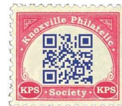
Knoxville Philatelic Society

The Knoxville Philatelic Society presents