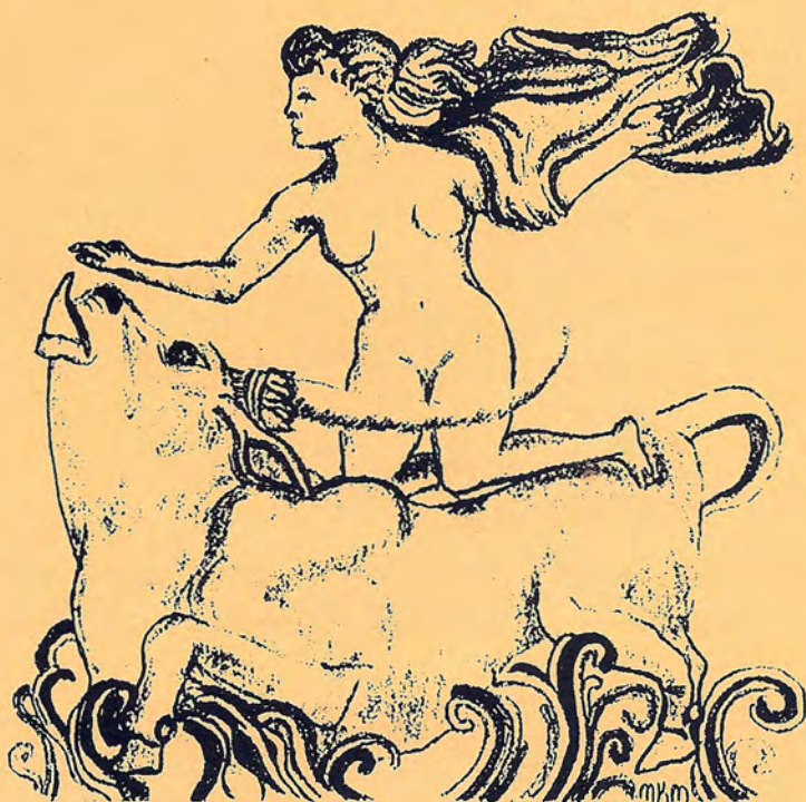
"Europa and the Bull" - Bronze Statue by Carl Miles on the campus of The University of Tennessee, Knoxville

Commemorating the 50th Anniversary of NATO