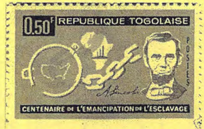
Republic of Togo 1963

Other countries have issued many stamps commemorating Lincoln and his achievements.